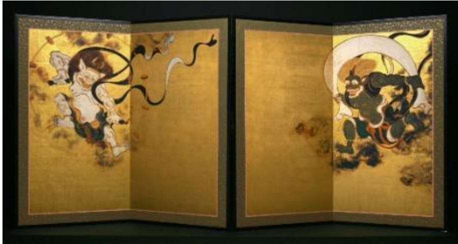
“MR Museum in Kyoto” viewing experience (image only)

Dimensions: 169.8 x 154.5 cm (each) Edo Period (17th Century) Kennin-ji Temple collection