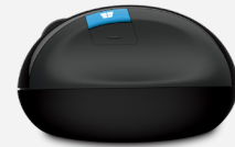
Microsoft Sculpt Ergonomic Mouse