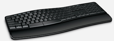
Microsoft Sculpt Comfort Keyboard