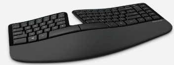
Microsoft Sculpt Ergonomic Keyboard